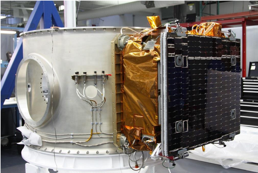
ORBCOMM's OG2 satellite mated to the Moog ESPA ring.

ORBCOMM anticipates launching the remaining eleven OG2 satellites and enhanced OG2 services in the fourth quarter of 2014 to complete its next generation constellation.